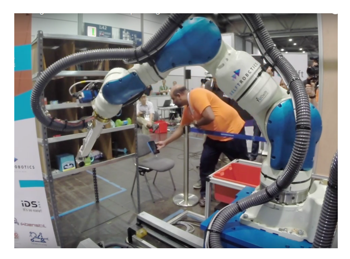
Figure 1: Team Delft Robot Setup for APC 2016.

The main responsibility of Team Delft's motion module for Amazon Picking Challenge (APC) 2016 is to ensure that our robot can move to all commanded locations to accomplish both the picking and stowing tasks in the challenge. The picking task consists of grasping an object of interest in the presence of other objects in the bin and placing the grasped object into a tote. The stowing task involves moving a certain object of interest in the tote to one of the bins in the shelf. The setup in reality is shown in Fig. 1.